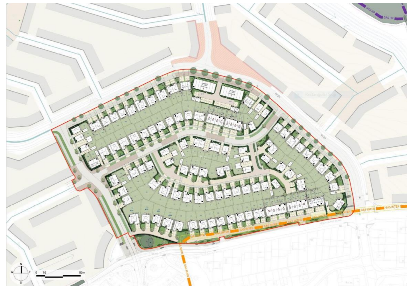
Indicative Site Layout Plan