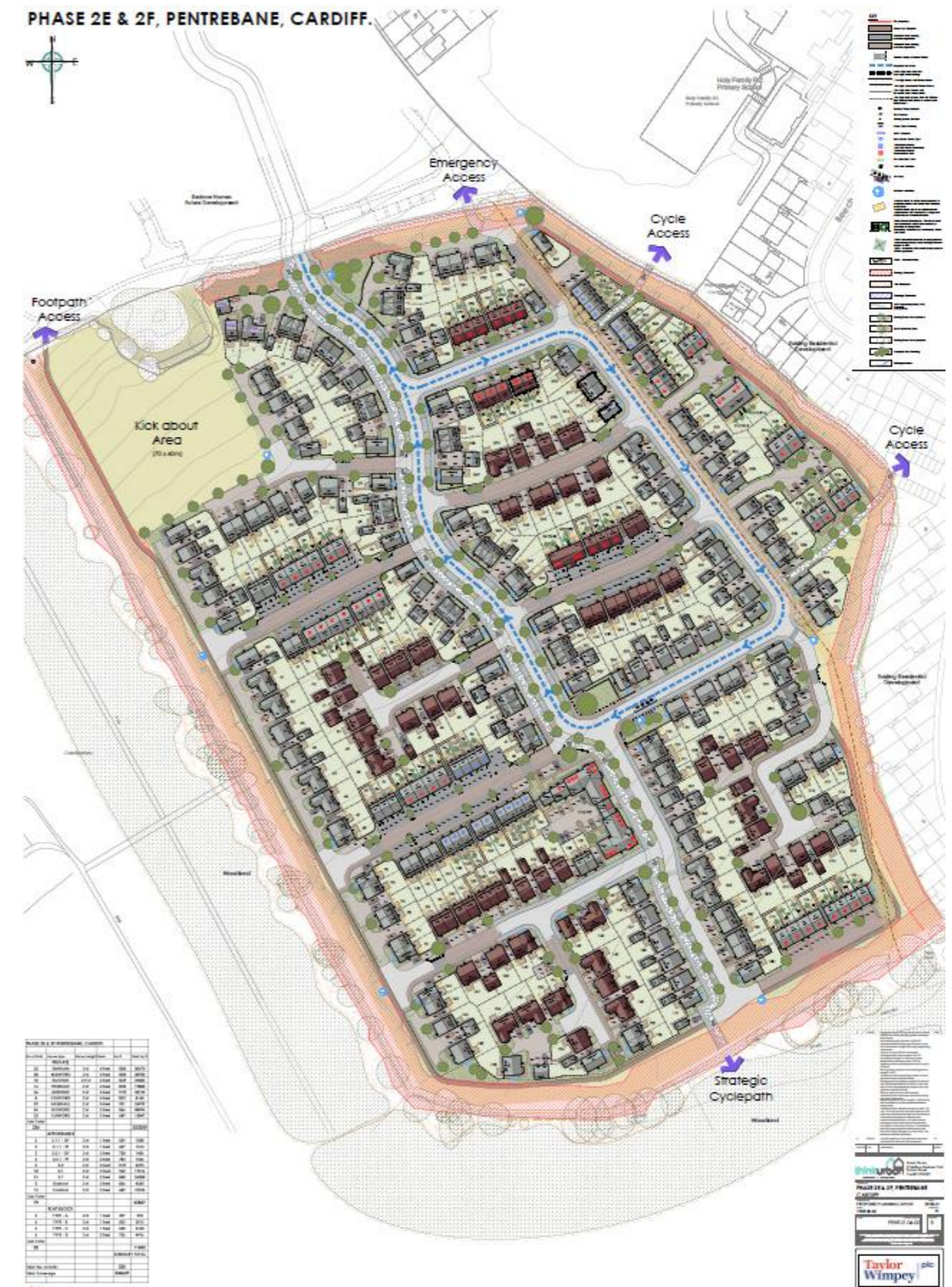
Indicative Site Layout Plan