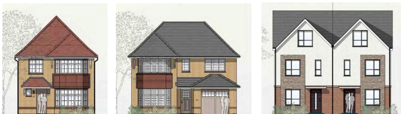
Indicative Illustration of House Styles