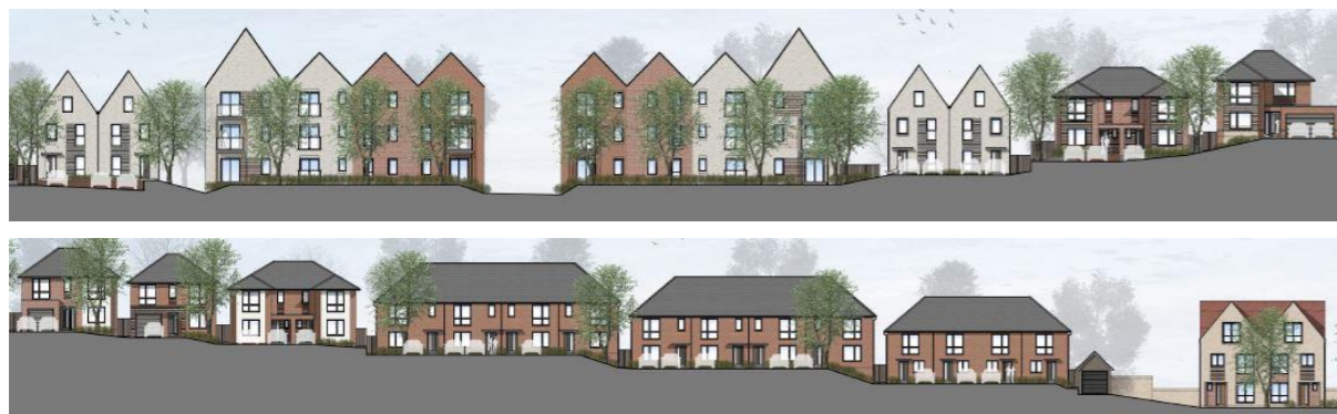
Indicative Illustration of House Styles