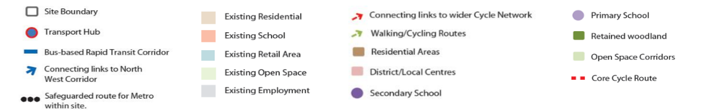
Strategic Site C: LDP Schematic Framework