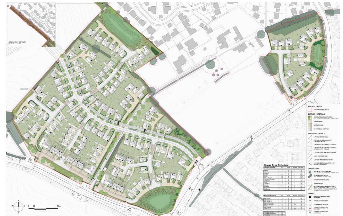
Indicative Site Layout Plan