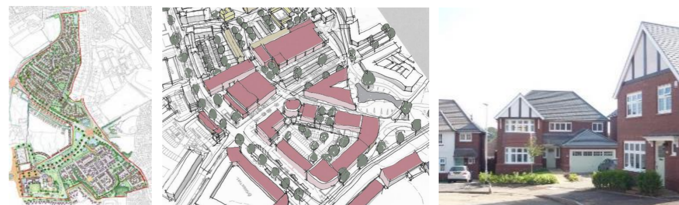
Indicative Illustration of Master Planning Approach