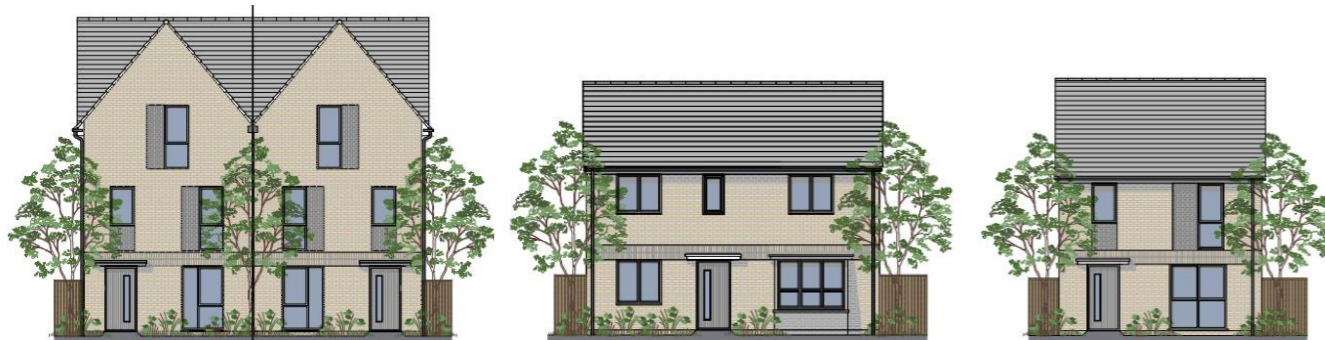
Indicative Illustration of House Styles