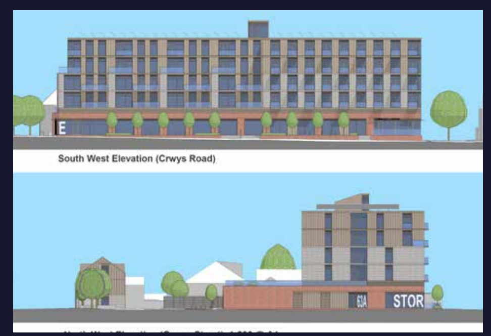
Medallion House, Crwys Road Rio Architects

Friary House, Greyfriar's Road Westworks Architects and Rio Architects