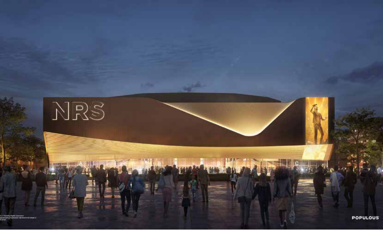
Cardiff Arena Populous Architects