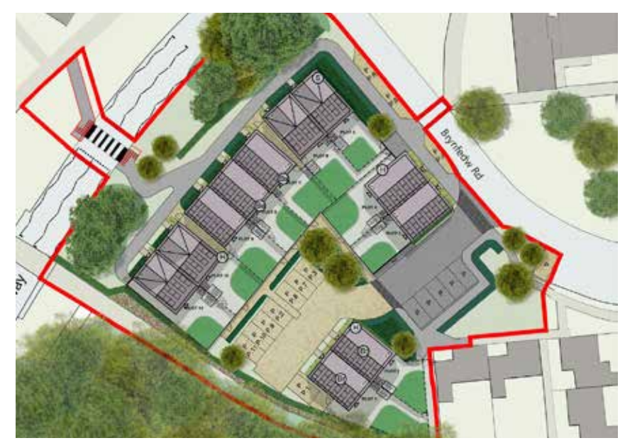
Site of the New Pennsylvania public house, Llanedeyrn, Powell Dobson Architects

A phase of the regeneration of the listed former department store. The principle of adding additional storeys to the existing Wharton Street building was accepted (outlined in red), following careful analysis of key views in a sensitive setting. There were some concerns about changes to the facade. The plan to expose the former Bethany Chapel and Sunday School was enjoyed. The landscape design for the emerging courtyard was considered to be good.