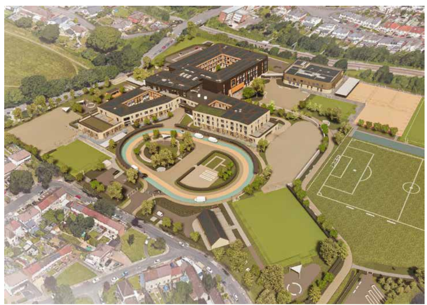
Cantonian Educational Campus HLM Architects

Cantonian Educational Campus (23/01501/FUL) Members of the Placemaking team advised the council's procurement team and process for the design work leading to this planning application. As a result, all of the major placemaking issues had been thoroughly resolved by the time the application was submitted for planning permission. The configuration and design of three schools on one campus was welcomed. The meeting discussed access and drop off, the design of the entrance plaza, scale and mass, neighbour impacts, the elevational treatments, the use of solar panels, arrangements for out of hours access, landscape design and the drainage.