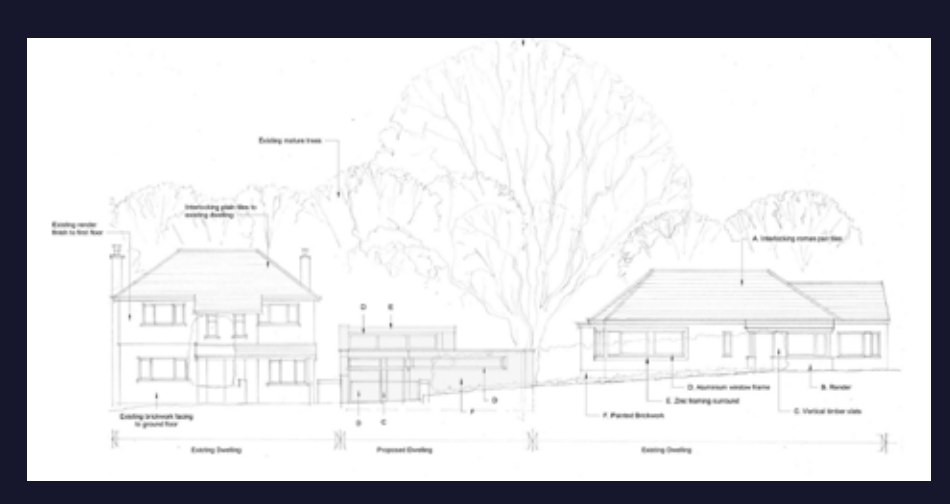
Friary House proposal in the Cardiff city centre and Bay model