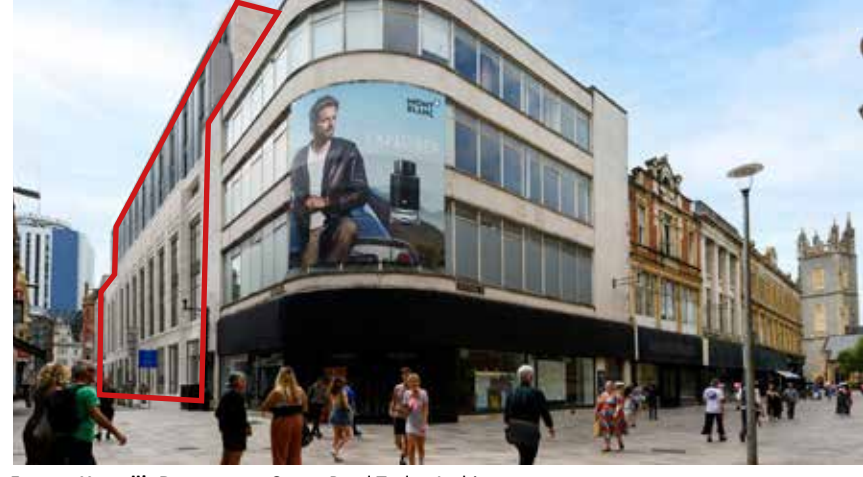
Former Howell's Department Store, Patel Taylor Architects