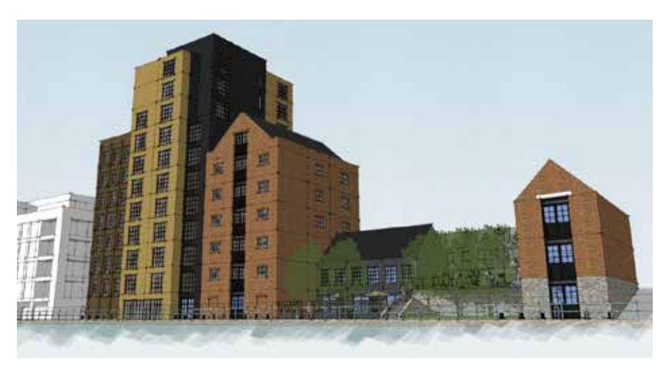
The Wharf Chris Waterworth Architects

A third iteration of this large proposal for dockside development. We queried the quantity and disposition of the communal provision in what is a co-living scheme. We also queried the viability of a cafe. The scheme is considered to be a very significant scale and some elements are out of character with the general scale of development in the immediate context. The buildings were considered an attractive mill pastiche.