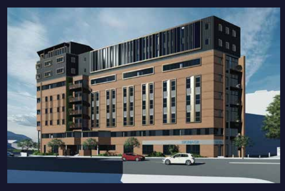
Knox Court Expedite Architects

Significant proposal for a new mosque in Cathays was considered broadly acceptable in terms of scale and mass, whilst its singularity and clean lines were considered acceptable, given the building's purpose. We queried the materials, if the whiteness is to prevail. Some aspects of the design drawings were considered a bit thin and we sought more information about the appearance of the domes.