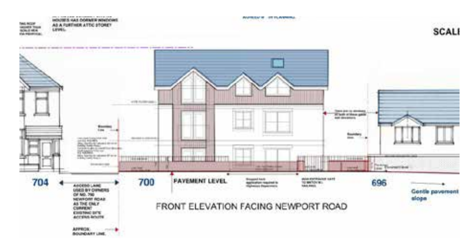
700, Newport Road David Owen Associates Architects

An example of a typical infill development. This was a revised submission that had been reduced in scale to sit more comfortably in its setting. We suggested that living spaces face south, and noted a poor provision for cyclists and positioning of bins. The "timber effect" cladding is not characteristic of the area.