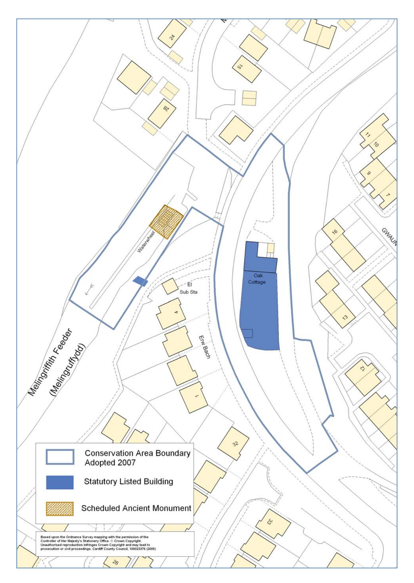
Map 1 Conservation Area Boundary